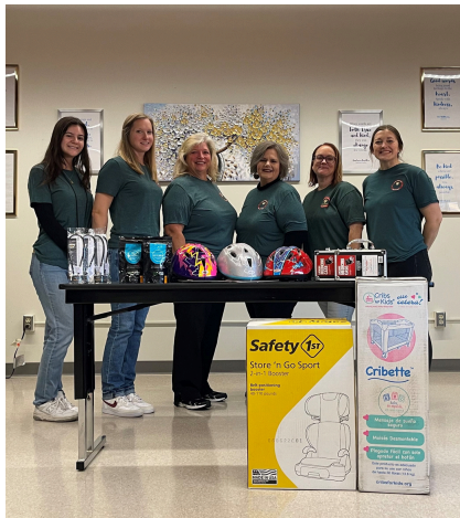
Wearing green for Injury Prevention Day

Gas station ad displayed Sept-Dec. with the warning signs of an overdose and promoting Narcan availability at LHDs