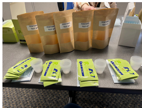
Packing fentanyl test kits