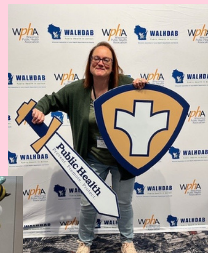
Wisconsin Public Health Association Conference